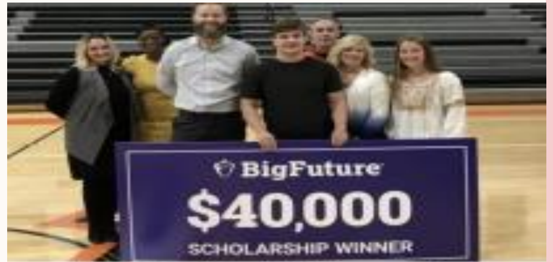
May 2022: Will from Illinois

BigFuture is a CollegeBoard Organization that helps students plan out their next steps after high school graduation and rewards them for it. By completing a few simple steps, you will be automatically entered into a drawing of two $40,000 scholarships and hundreds of $500 scholarships every month.